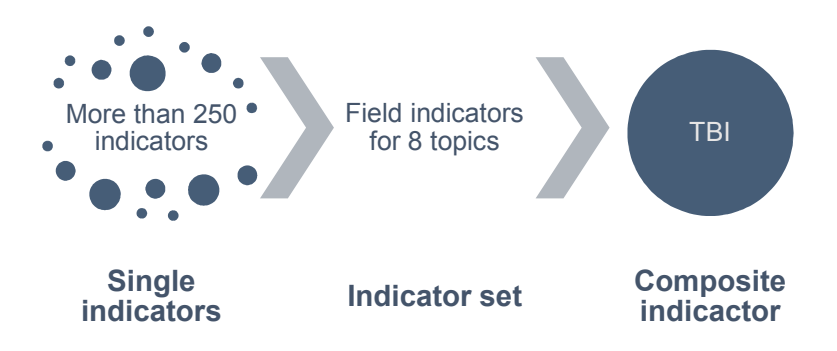
Figure 1:Steps from single indicators to the TBI